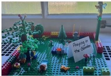
Praying in the Garden

The first ever COCU Lego Challenge was held on Palm Sunday and boy can our congregation build! Not only did we have a great time working together in teams of all ages, but if the laughter was any indication, everyone had fun! Thank you to all of the participants!