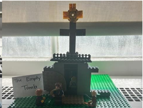
The Empty Tomb