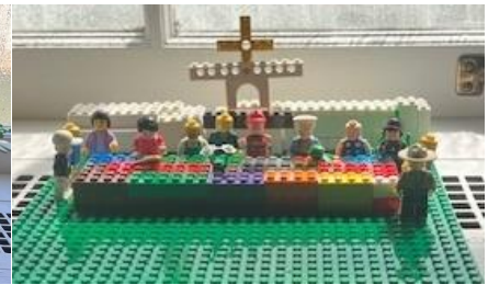
The Last Supper