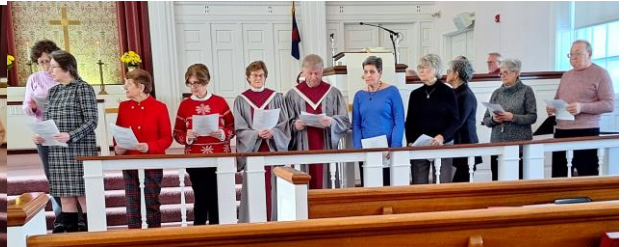
Commissioned and Installed - Details on Page 7